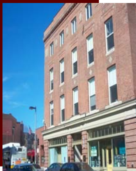
184 Dudley Street